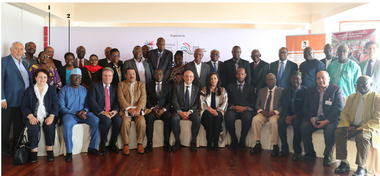
• • • Participants of Africa in Action Meeting

The Vice President of IPA, Bodour Al Qasimi gave the concluding remarks. She expressed her appreciation to APNET and ADEA for the MoU signed. Bodour indicated that already a lot has been done and the Lagos Action Plan would be circulated to all participants during the Nairobi Seminar. She encouraged African publishers’ associations to join IPA to increase the membership from 10 and added Ghana would soon join IPA. Dubai Cares has donated US$800,000 to African Publishing Innovation Challenge Fund to work on innovative projects on publishing in Africa.