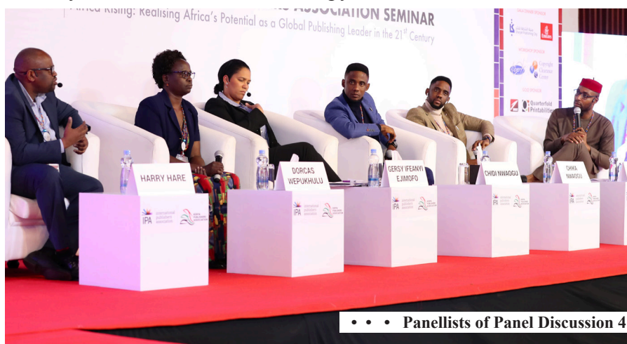
• • • Panellists of Panel Discussion 4

“If publishers look at tech as a tool to help people who have been excluded from reading they will see technology is a must — it is unavoidable and necessary”. She also asked if only publishers could embrace technology as a way to reach new bottom-of-the-pyramid readers.