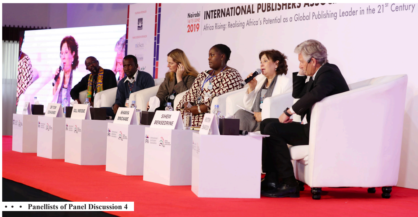
• • • Panellists of Panel Discussion 4

The presentation of certificates was a gloriously protracted affair. It reached a splendid climax when all the executives from the IPA and the heads of the Nigerian and Kenyan publishers associations reappeared from a side room dressed like Masai Mara tribesmen. Delegates were then treated to a high energy performance by the Sarakasi dance troupe who span, tumbled and somersaulted across the stage. 'Sarakasi' means 'circus' and this performance had all the thrills and energy of the big top!