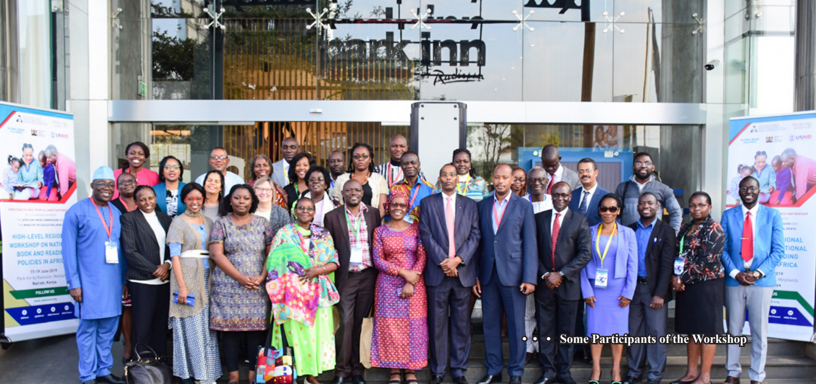
• • • Some Participants of the Workshop