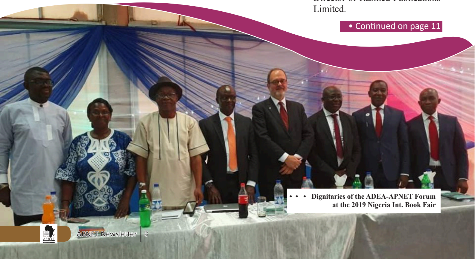
• • • Dignitaries of the ADEA-APNET Forum at the 2019 Nigeria Int. Book Fair