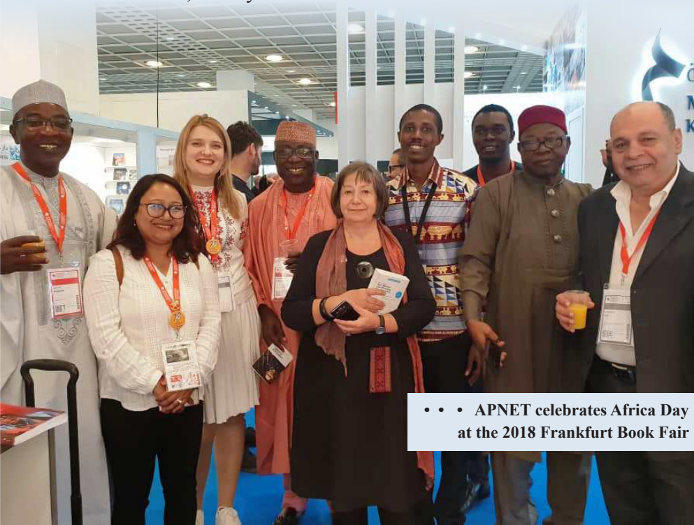
• • • APNET celebrates Africa Day at the 2018 Frankfurt Book Fair

The participation of publishers from Africa in international book fairs is relevant for the following benefits: book visibility, trading of rights, partnership prospects, learning of best practices, acquisition on industry knowledge and networking.